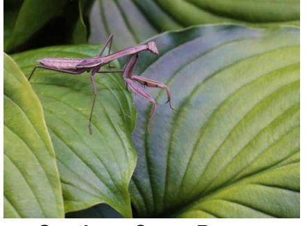
Southern Cross Bronze "Mantis on Hosta" Geoff Peters, USA