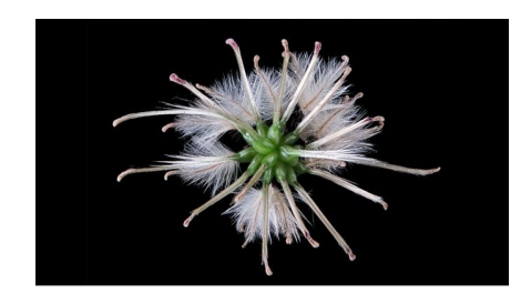
Best of Show "Flower 49" Greg Duncan, England