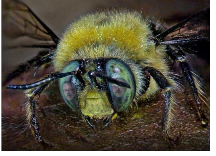
"Lookin Atcha" Jack Muzatko, USA