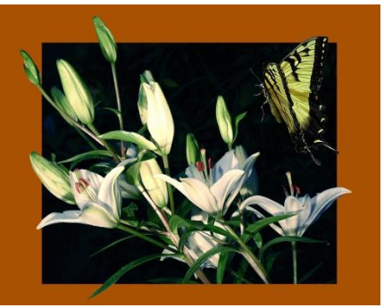
Creative "White Flowers and Butterfly-1" David W Allen, USA