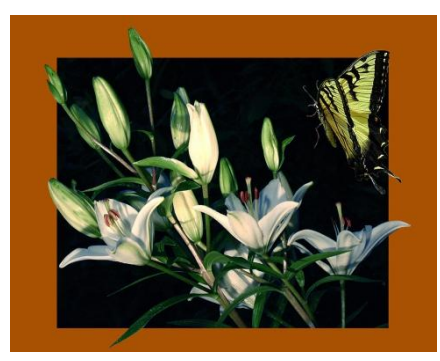
Creative "White Flowers and Butterfly-1" David W Allen, USA