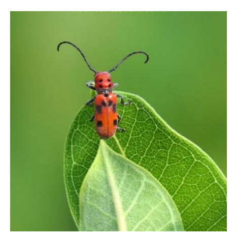
"Red Milweed Beetle" George Themelis, USA