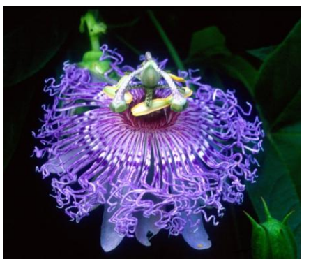
"Purple Passion Flower" Dennis Green, USA