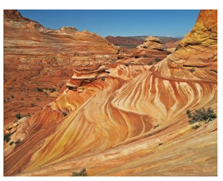
"Between Coyote Buttes" Lee Pratt, USA