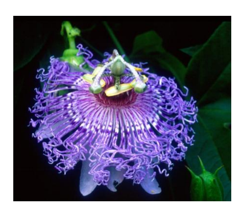
"Purple Passion Flower" ennis Green, USA