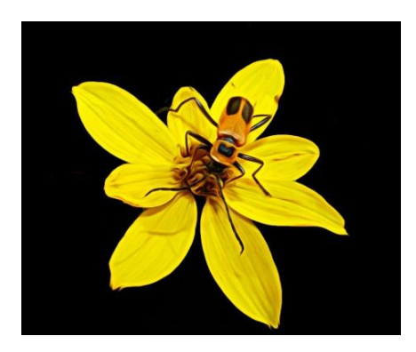
"Goldenrod Soldier" Ursula Drinko, USA