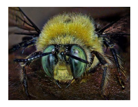
"Bee 2" Jack Muzatko, USA