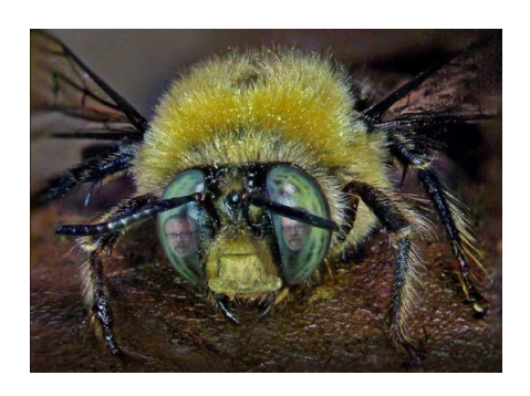
"Lookin Atcha" Jack Muzatko, USA