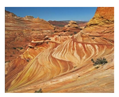
"Between Coyote Buttes" Lee Pratt, USA