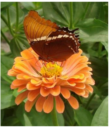
"Brown Tip on Orange Zinnia" Geoff Peters, USA