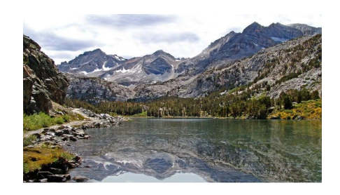
"Long Lake Reflection" Jack Muzatko, USA