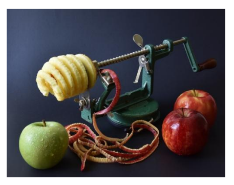
"Apple Spiral" Stefan Hreszczuk, Australia