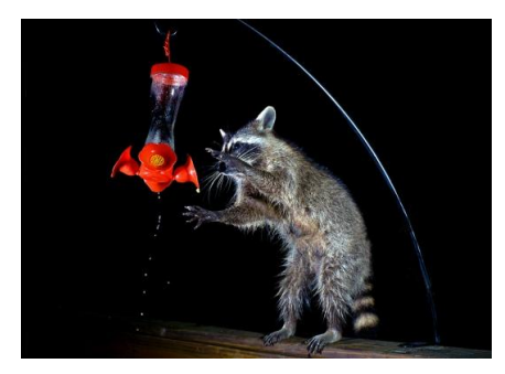
"The Twizzler" Chris Reynolds, USA