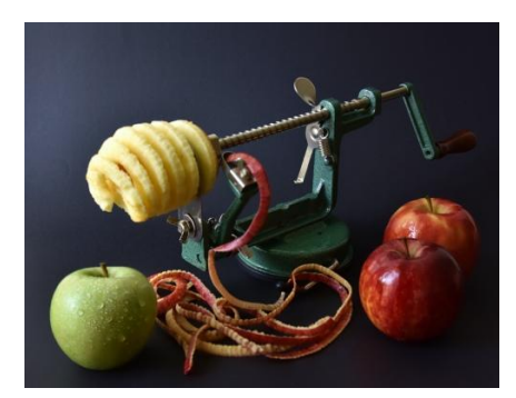
"Apple Spiral" Stefan Hreszczuk, Australia