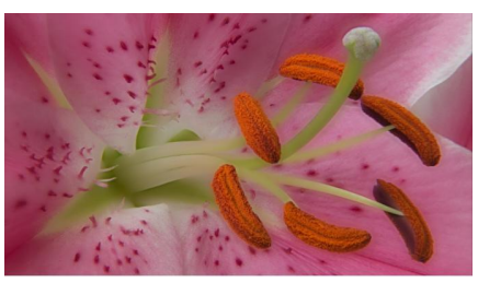
Southern Cross Bronze "Flower 15" Greg Duncan, England