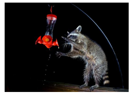
"The Twizzler" Chris Reynolds, USA