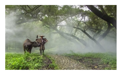
Best of Show "Foggy Morning Work" Henry Ng, USA