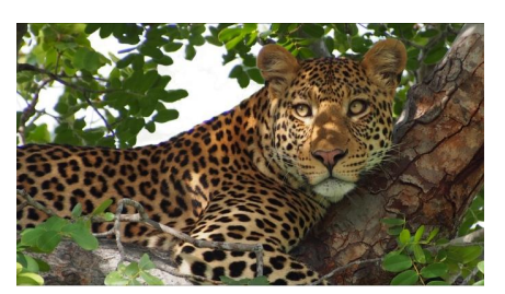
Second Best of Show "Botswana Leopard" Steve Hughes, USA