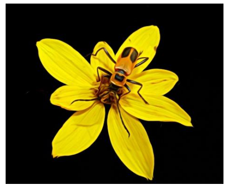
"Goldenrod Soldier" Ursula Drinko, USA