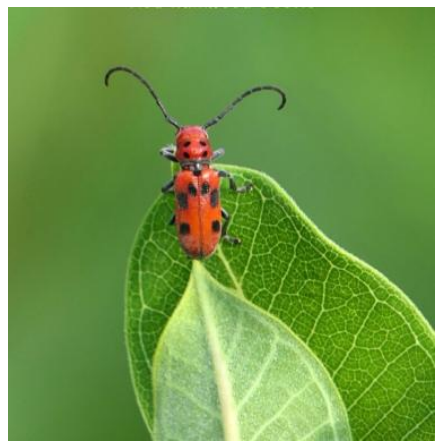
"Red Milweed Beetle" George Themelis, USA