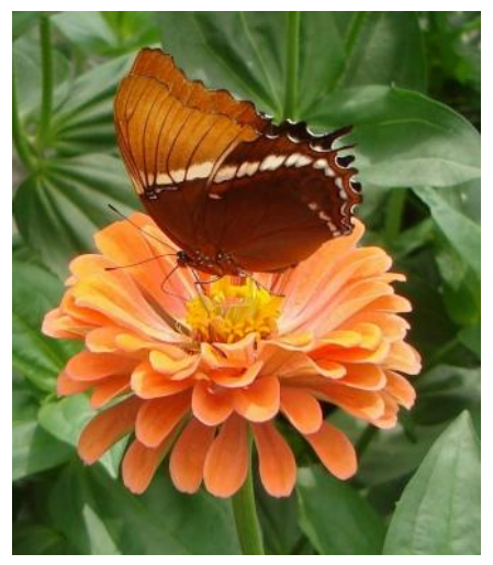
"Brown Tip on Orange Zinnia" Geoff Peters, USA