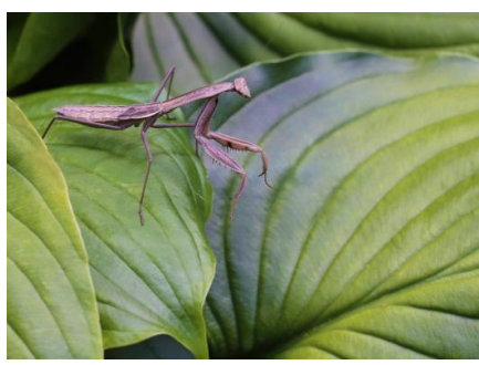
Southern Cross Bronze "Mantis on Hosta" Geoff Peters, USA