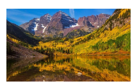
New Southern Cross Exhibitor New Southern Cross Exhibitor "Marion Bell Fall 4" Henry Ng, USA