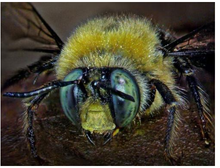
"Bee 2" Jack Muzatko, USA